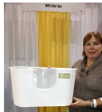
NVR Miss Litter Box

Size, location and design of the box makes a difference to most cats. Make it easy on yourself by meeting your cats' preferences. Scoop at least twice daily and remove all urine and feces. If a cat stops using a cleaned box, there could be a medical problem, so see your veterinarian.